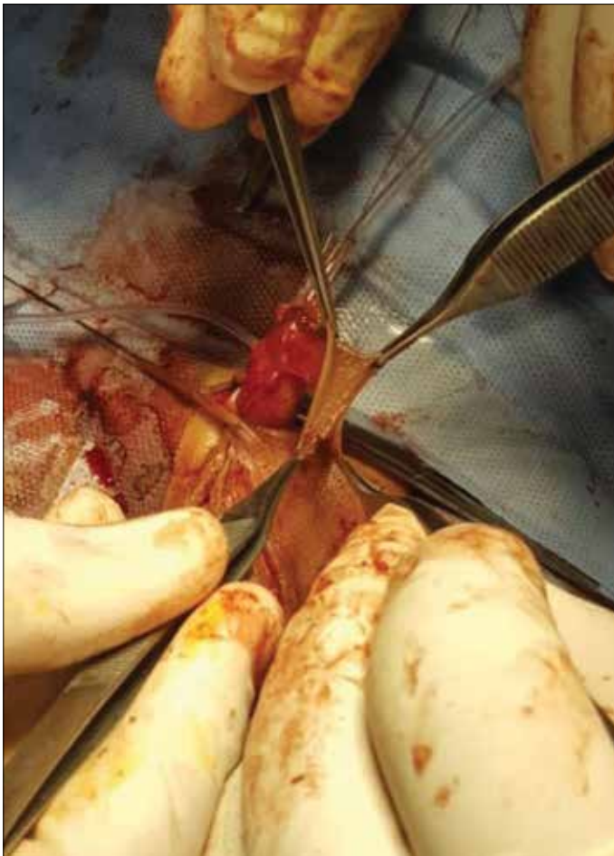
Figure 3. The proximal part of the dartos pedicle was used as a second layer for the neourethra

skin proximal to the mucosal collars of the ventral coronal sulcus intact (Figure 3, 4) but if the pedicle flap was enough to reach the neourethra without tension, it could be applied over the neourethra. But the distal part of it which covers the urethral part and will be under the glanular wings and coronal sulcus was de-epithelialized keeping the remaining skin as a cover for the ventral aspect of the penis suturing it to the lateral penile skin edges and proximal skin edge at the original meatus. Then the distal margin of the dorsal penile skin was sutured to the mucosal collar at the coronal sulcus and after completion of suturing all around, soft dressing was applied. The incidence of the skin necrosis, urethrocutaneous fistula, wound dehiscence and meatal stenosis were recorded and analyzed statistically.