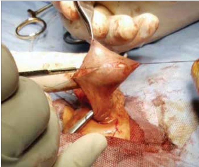
Figure 2. Transverse skin incision at the junction of the prepuce and penile skin