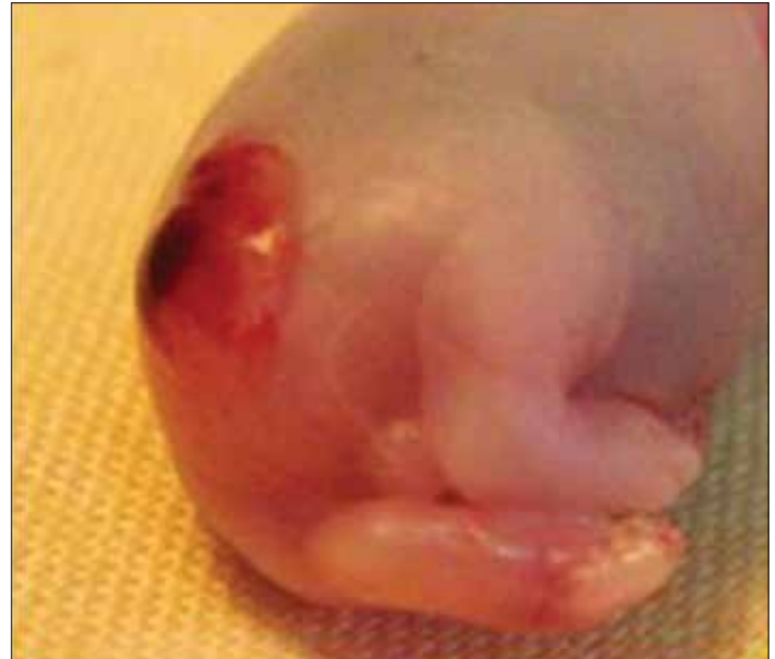
Figure 1. Macroscopic appearance of rat fetus with myelomeningocele

On the E 22, all dams were anesthetized with ether and the surviving fetuses were harvested by cesarean section, then the dams were sacrificed by cervical dislocation. Fetuses that had a MMC