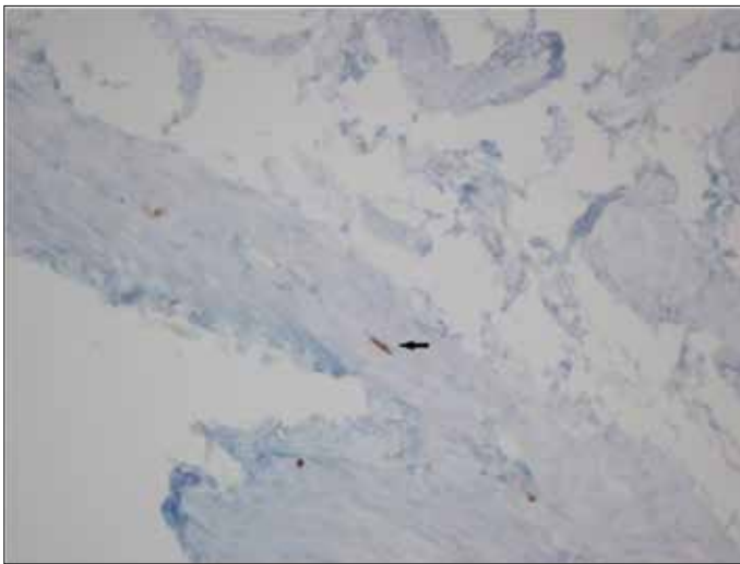
Figure 3. Histopathology of the fetal rat bladder of the control group (arrow indicates interstitial cells of Cajal located in the muscular layer with fusiform cell body, thin cytoplasm, wide ovoid nucleus and two dendritic processes) (C-kit, x40)

Cajal cells in c-kit positive mast cells. Negative control samples were identically stained with study samples without primary antibodies.