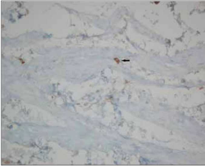
Figure 2. Histopathology of a fetal rat bladder with an arrow indicating a mast cell (C-kit, x40)