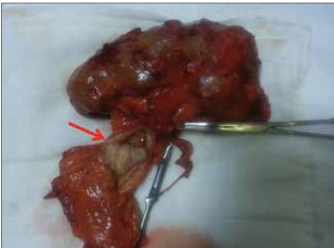
Figure 2. Gross view of the nephroureterectomy material

revealed high grade urothelial carcinoma ureter in the allograft kidney with the stage pT3 disease. The patient is followed up after cessation of the immunosuppressive therapy. Informed consent of the patient was taken from the patient.