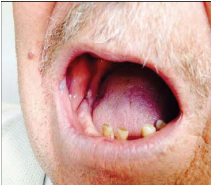
Figure 2. Photograph of the patient with right mandibular bulging and swelling

did not reveal any pathology or metastasis. After diagnosing mandibular metastasis, his treatment modality evolved to a combination of luteinizing hormone-releasing analog and bisphosphonates to prevent skeletal related events. Six months later, docetaxel-based chemotherapy was initiated because of disease progression to the castration resistant level. In addition to the mandibular metastasis, metastatic lesions in the thoracic 10 th vertebrae and 10 th rib were also observed on bone scintigraphy, which was repeated 1 year after the first one. The patient's current PSA level is 4.63 ng/mL, after receiving eight courses of docetaxel chemotherapy repeated at 3-week intervals.