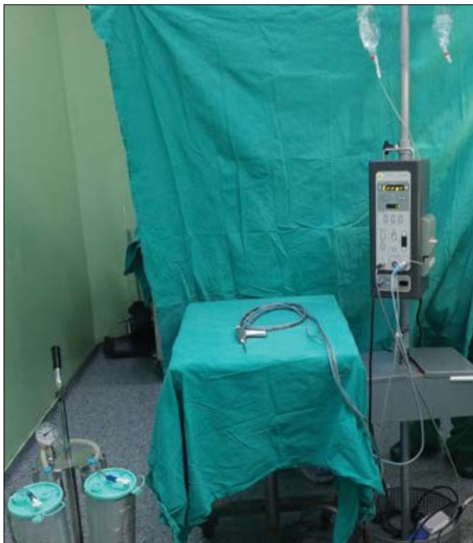
Figure 3. Microdebrider, general view

The traditional approach was the extensive wide excision of the scar tissue for the implantation of penile prosthesis in cases with severe corporeal fibrosis. In this technique, a wide corporotomy is performed, and the fibrotic corporeal tissue is dissected from the tunica albuginea. The reoperation, infection, and malfunction rates of the device were reported to be 30%-50%, 18%-30%, and 6%-12%, respectively. [7,8,13-16] Wilson et al. [17] reported