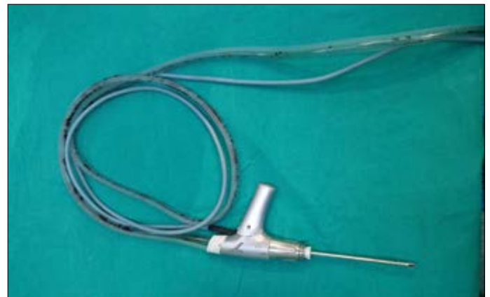
Figure 1. Microdebrider blade

Following urethral catheterization, the layers were sharply dissected and stay sutures were placed in the tunica albuginea on either side. A 1–1.5 cm incision was made to the corpora. A small tunnel was created inside the scar tissue using the Metzenbaum scissor. Hegar dilatation was not attempted because of the dense fibrotic tissue seen in the corpora. The microdebrider (Diego, Gyrus ACMI-ENT Division, Bartlett,