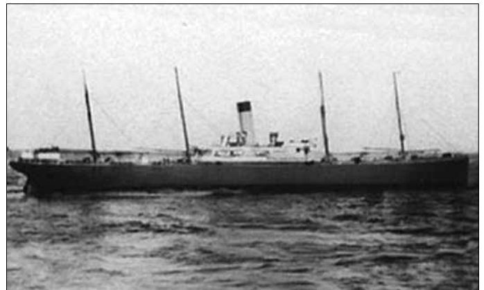
Figure 2. SS Californian (1901-1915)