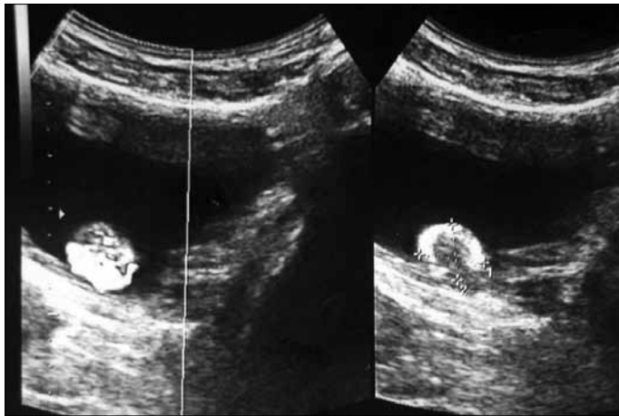
Figure 1. Ultrasonography revealing a 4 cm size heterogeneous mass in the bladder dome.

(Figure 1). Cystoscopy revealed a 50×40×10 mm smooth polyp with papillary area on the bladder dome. Therefore, transurethral resection of the bladder was performed. An examination of the resection specimen revealed a mixed malignant tumor with epithelial (squamous cell carcinoma) and mesenchymal (rhabdomyosarcoma) elements, which is consistent with carcinosarcoma (Figure 2). Immunostaining was performed. Areas of squamous cell carcinoma stained positive for keratin and epithelial membrane antigen. The sarcomatous component stained positive for vimentin, desmin, and myoglobin. These results confirmed the carcinosarcoma diagnosis. Computed tomography was performed one month later and revealed a contrast-enhanced thickness of the bladder dome (Figure 3). The patient underwent neoadjuvant chemoradiotherapy. Radiation therapy (XRT) of 40 Gy was administered with carboplatin (100 mg/m 3