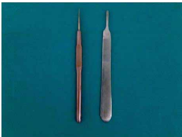
Figure 2 Beading awl after removal as compared to a scalpel.